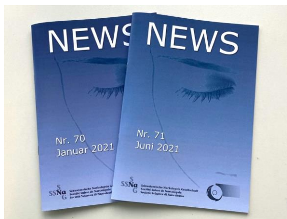
Figure 1 Info bulletins NEWS of the SNaG

Our members receive an informative bulletin ( in German language ) twice a year on our social activities and on current medical topics (Fig. 1).